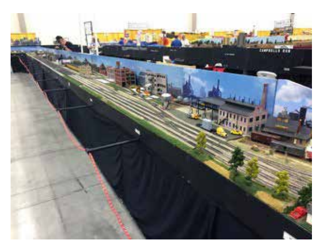
Division 1 brought a loop, corner and enough regular modules to give them a leg of the layout.

Tower operators Scott Carter and Rudy Slovacek (Hub) try to clear a traffic jam at the two junctions. Hub's bridge module connected the two junctions and allowed staff to get from one side of the layout to the other.