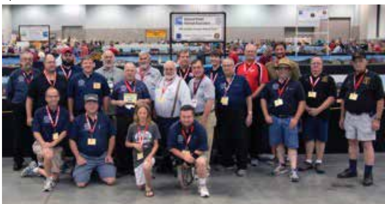
The Division 4, Division 1 and Hub Division staff for 2016 NTS