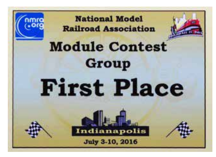
Group Layout First Place Award plaque