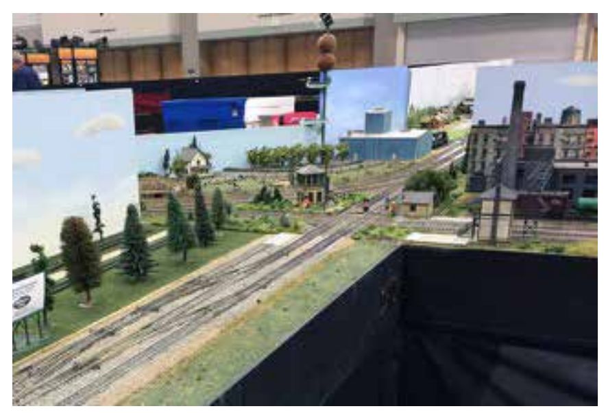
The Hub Diamond, leading to Division 4 modules on three legs of the layout.